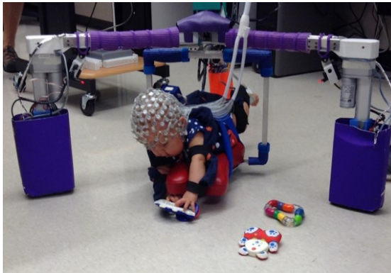
SIPPC Assistive Robot

The Self-Initiated Prone Progression Crawler (SIPPC) is an assistive robot that aids infants at risk for Cerebral Palsy as they learn how to crawl. The robotic platform supports an infant's weight and amplifies her crawling-like movements by carrying her across the floor in the indicated direction. This interaction serves to encourage the infant to continue practicing crawling movements and allows the infant to actively explore her immediate environment.